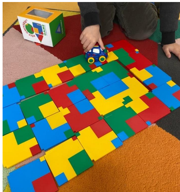
Figures 1, 2, 3: Constructions with squares